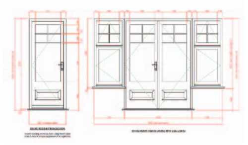
Attention to detail. The design concept pre-manufacturing stage