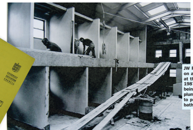
JW Rihoy & Son working on an integrated workshop at the College of FE in 1987. These bays were being made to enable plumbing apprentices to practise installing bathrooms and kitchens.