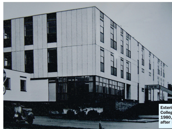
Exterior shot of College of FE from 1980, just four years after it opened.