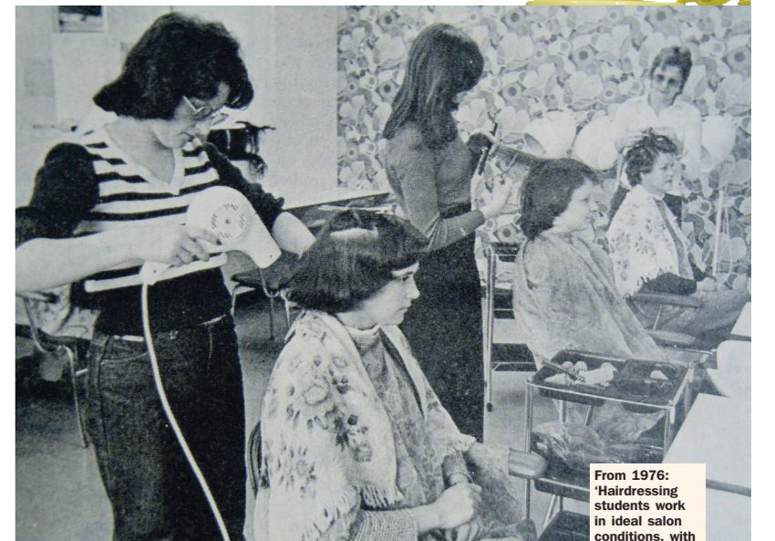
From 1976: 'Hairdressing students work in ideal salon conditions, with friends who volunteers as models.'