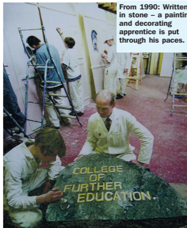
From 1990: Written in stone – a painting and decorating apprentice is put through his paces.

In 1971, plans were prepared for the construction of a purpose-built college to meet the increasing demand for facilities