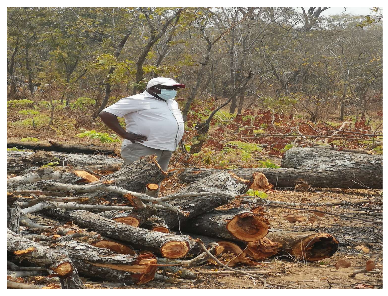
Precious miombo forests around the buffer zone are under assault to give way for farmland and for firewood for curing Virginia tobacco