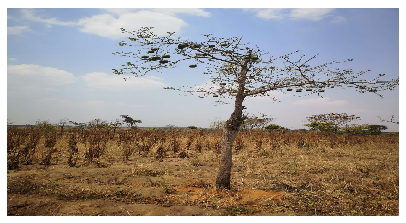
Standing dry Virginia tobacco stems testify to the existence of a tobacco farm just about 50 meters from the boundary of the Park and most likely illegally encroaching the Park for firewood. Park official told me this tree with fruits is listed as endangered by CITES