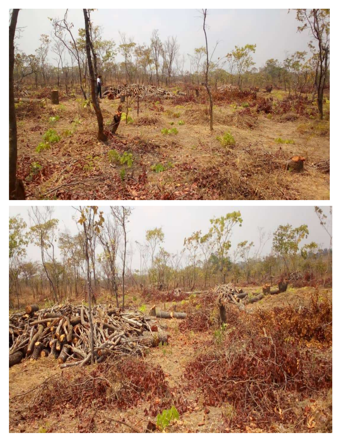
Sadly, some powerful political forces and local chiefs, are instigating the wanton destruction of this natural heritage and carbon sink